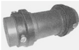
'RRS' Type Coupling