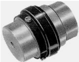
'SW' Type Coupling