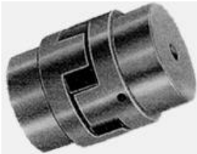
'L' Type Coupling

Universal Star Couplings ensures quick and easy installation in reciprocating pumps, generator sets, diesel and gas engines and other such drives, in a way, coupling installation requires no special tools due to simple construction, even other spider arm is an idler and can be advanced to the load carrier jaws & thus functioning as a spare spider in every coupling.