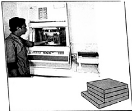
Rubber Compound Testing