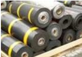
NBR-EPDM Rubber Sheeting