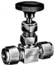
Stainless Steel Needle Valve

End Connections: Screwed to BSP/BSPT/NPT thread, socket connection, double ferrule tube fitting.